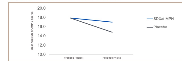
Figure 2. Mean Absolute SKAMP-C Scores

§ Difference (active drug minus placebo) in least-squares mean change from baseline.